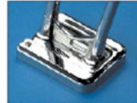
Optional Mounting Shoe